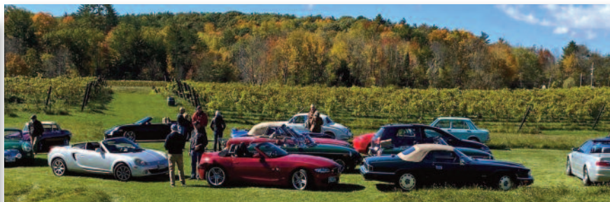
October 12—Fall Peepers Rally